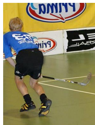
Using a left stick